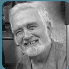
SCOTT WALKER At Large 2