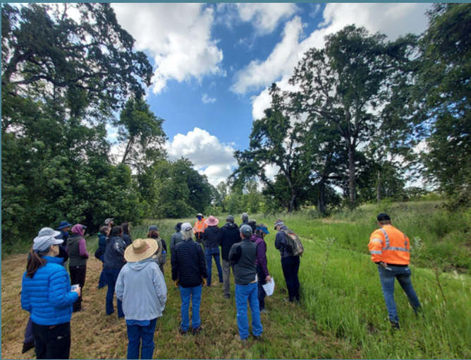
Tour attendees at the City of Salem's Gaia property.

By Chelsea Blank Natural Areas Conservation Planner