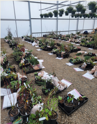
Assembled orders await pick-up.